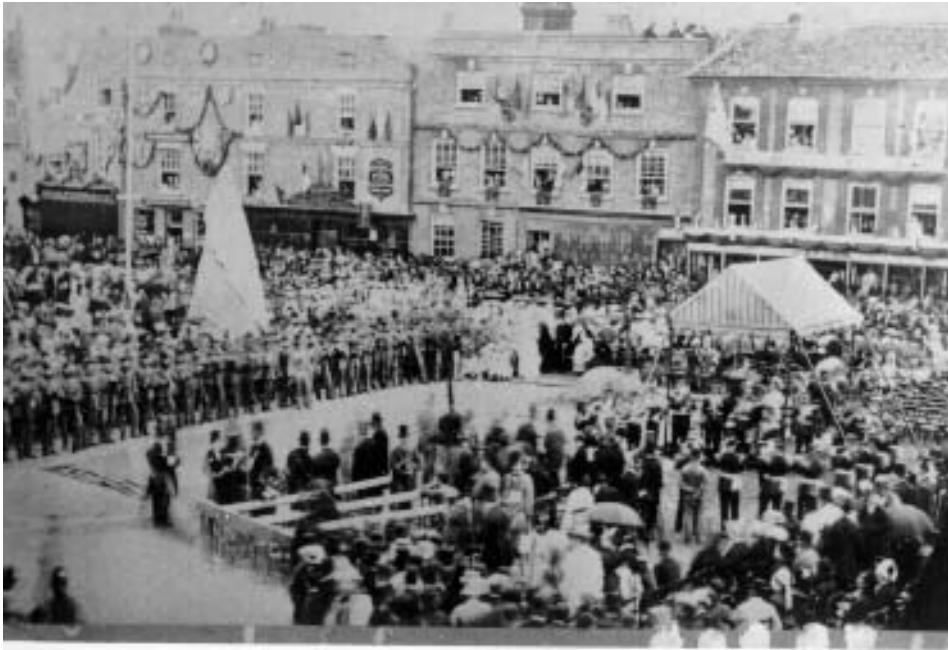
Wantage Market Place - 14 Jul 1877 - unveiling of King Alfred's Statue by the Prince of Wales (later Edward VII) on tented dais on right, band of Grenadier Guards beside, and Wantage Volunteer Corps opposite - large crowd. (poc003.jpg)