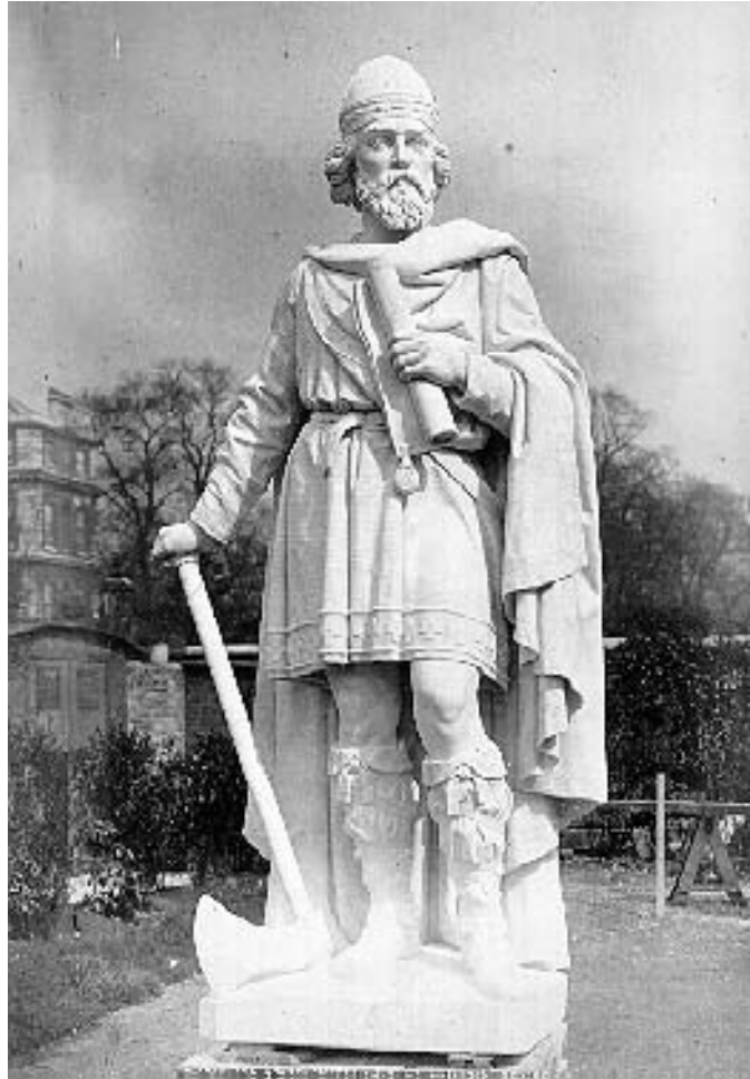
King Alfred's Statue - Oct 1876 - in grounds of St. James Palace, before transfer to Wantage. Commissioned by Col. Loyd-Lindsay and sculpted by Count Greichen (nephew of Queen Victoria). (mp117.jpg)

the laws powerless and he gave them force the church debased and he raised it, the land ravaged by a fearful enemy from which he delivered it. Alfred's name shall live as long as mankind shall respect the past.